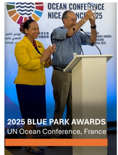
2025 BLUE PARK AWARDS UN Ocean Conference, France